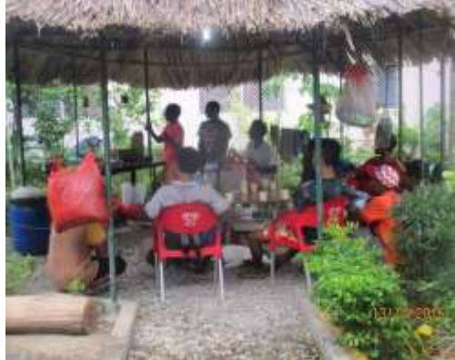
There are 6 students in the Postulancy Program and 10 more will join us in the Pre-Postulancy Program in February 2017.